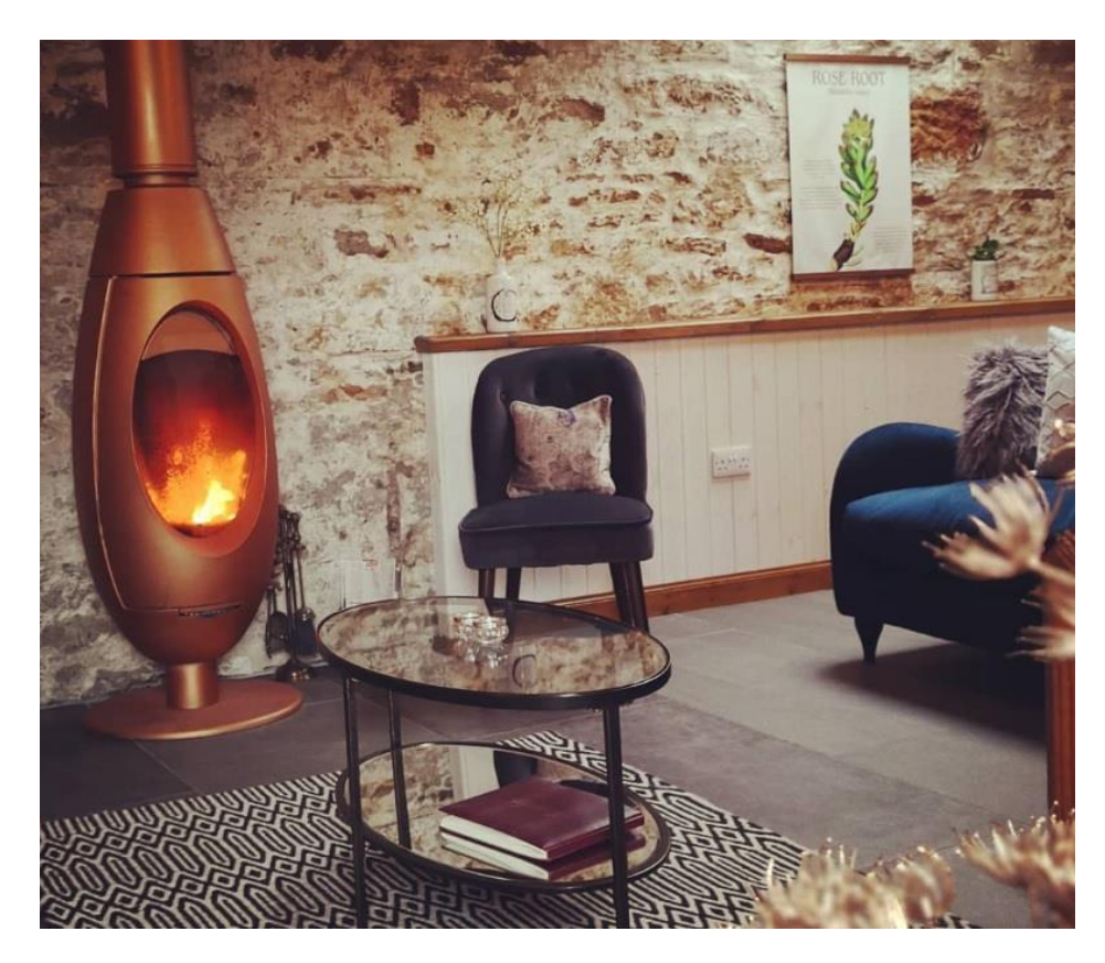
Seating area in the Tasting Room.