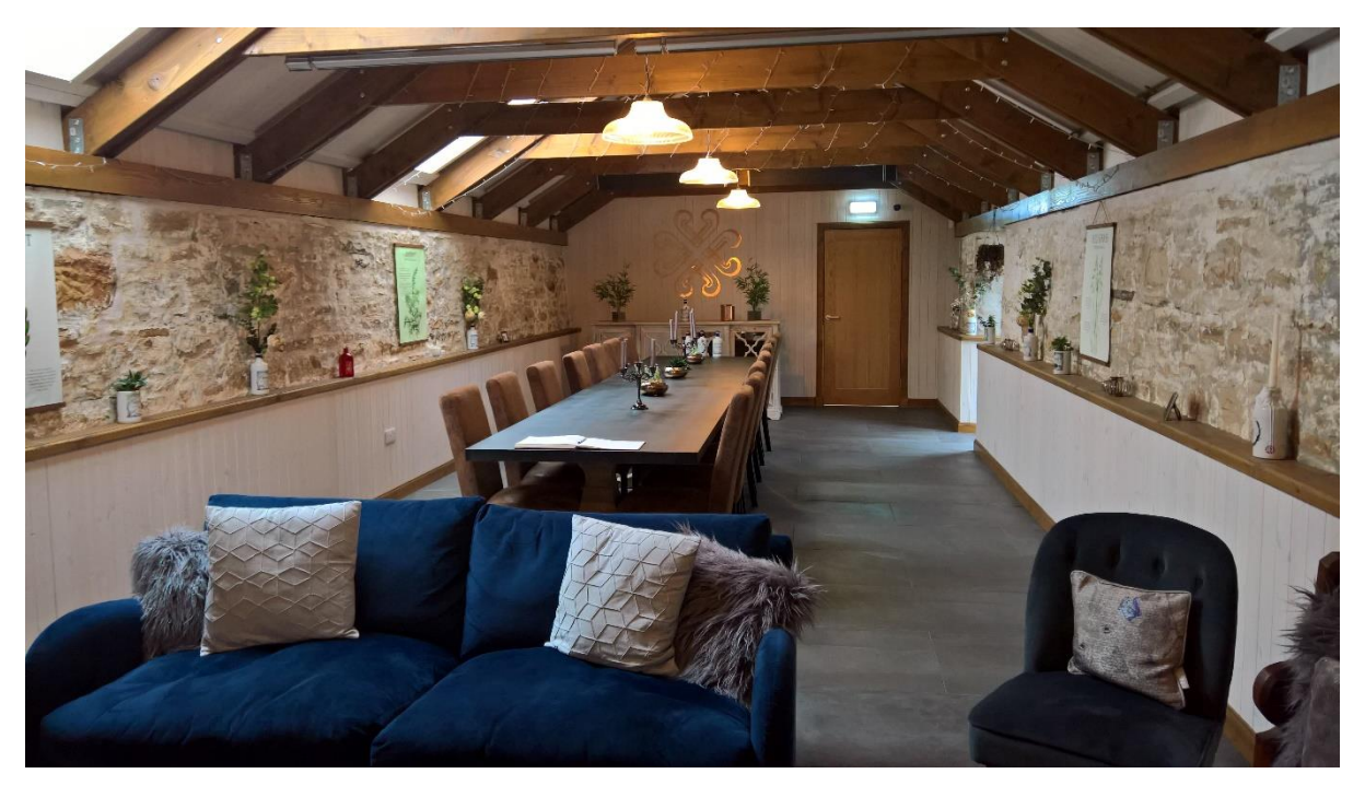
Seating area and tasting table in the Tasting Room.