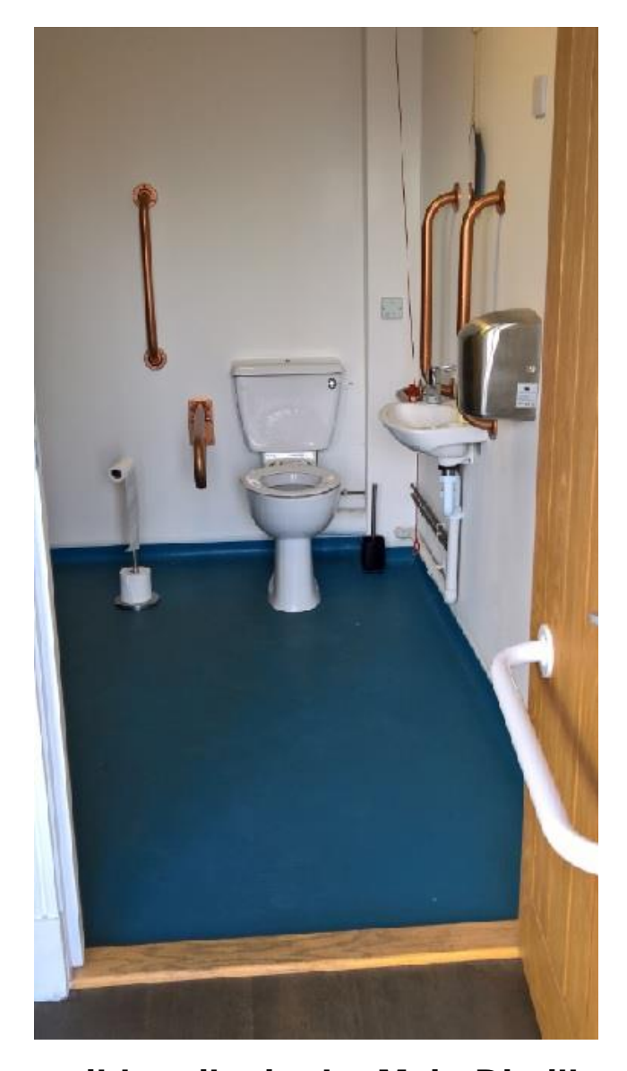
Unisex accessible toilet in the Main Distillery Building.