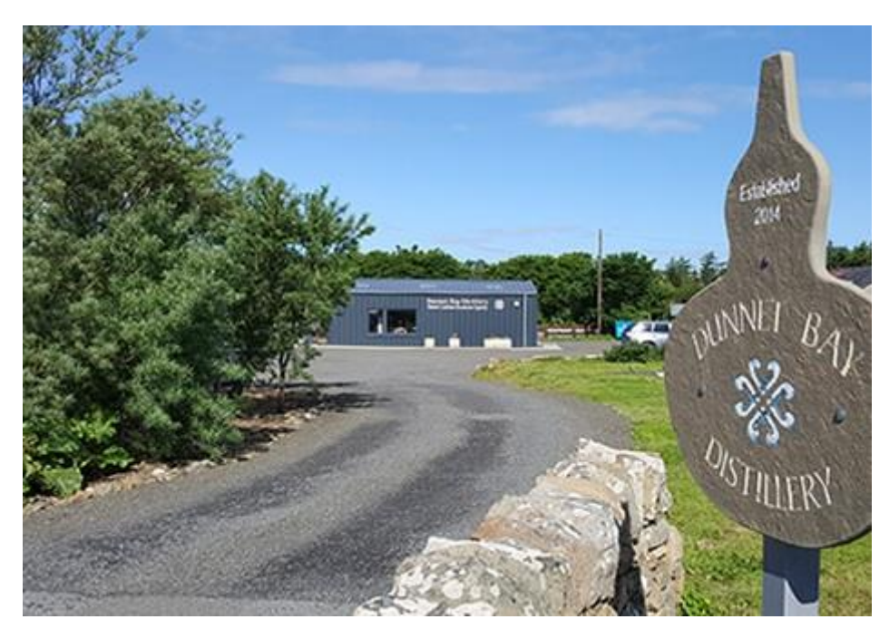
Drive leading to Dunnet Bay Distillery.