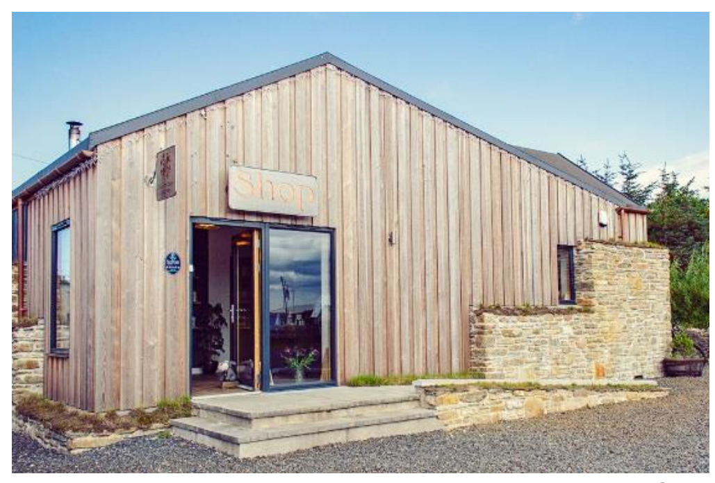
Distillery car park and main entrance to the Visitor Centre.