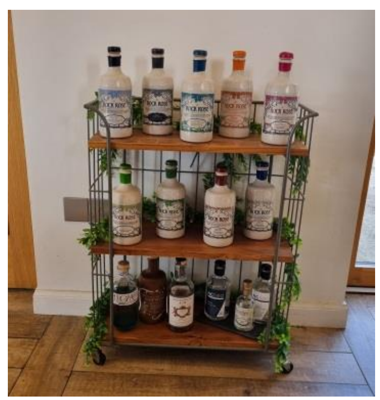
Spirit Tasting Station.