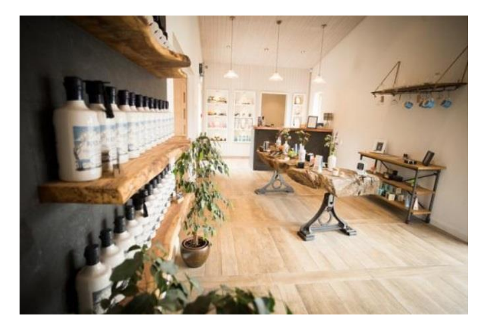
Interior of the Shop located in the Visitor Centre.