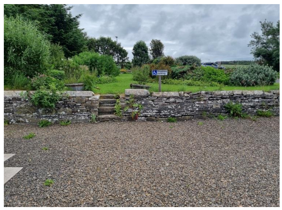
Parking space for Blue Badge holders.