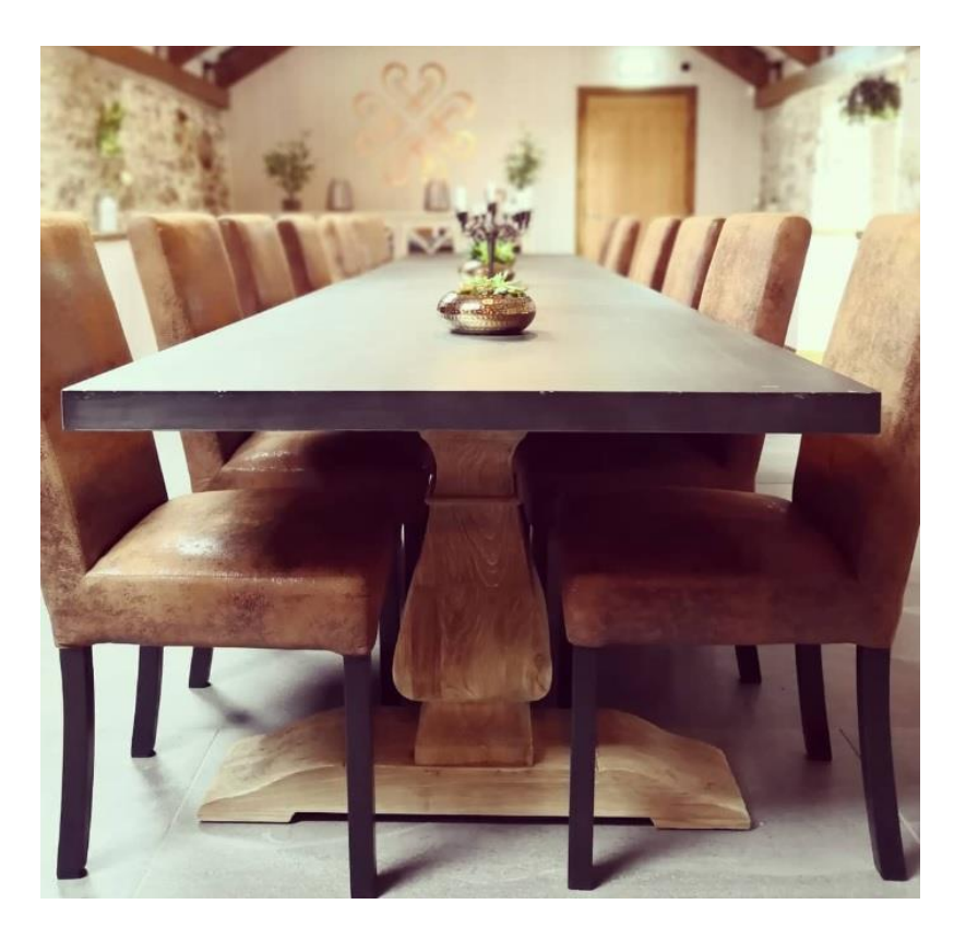
Tasting table in the Tasting Room.