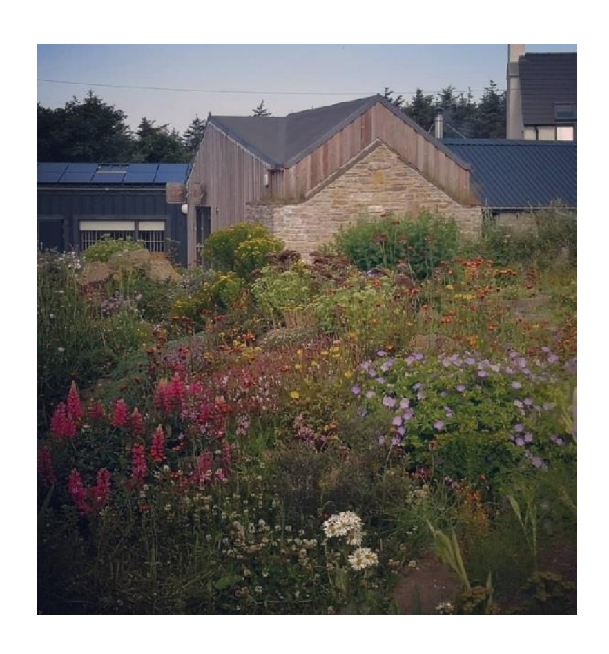
Distillery Herb Garden.