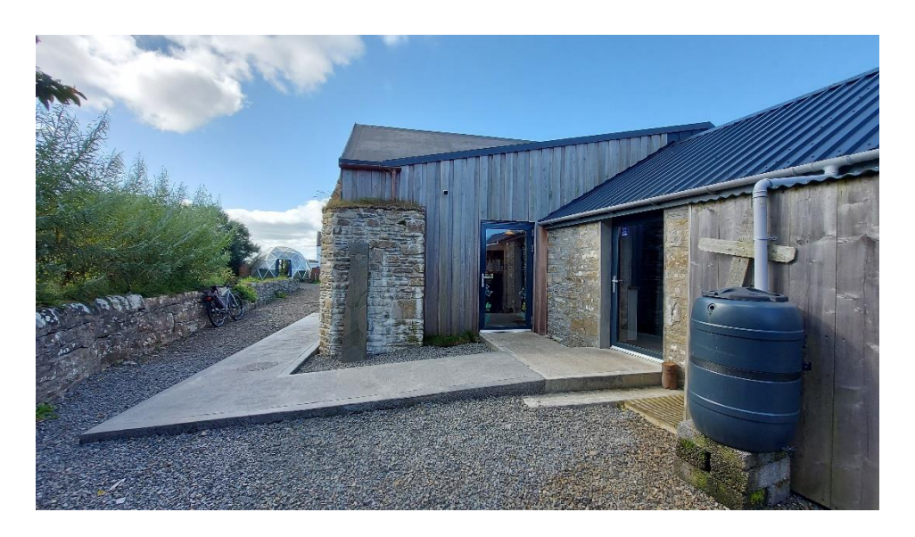
External side entrance to the Tasting Room.