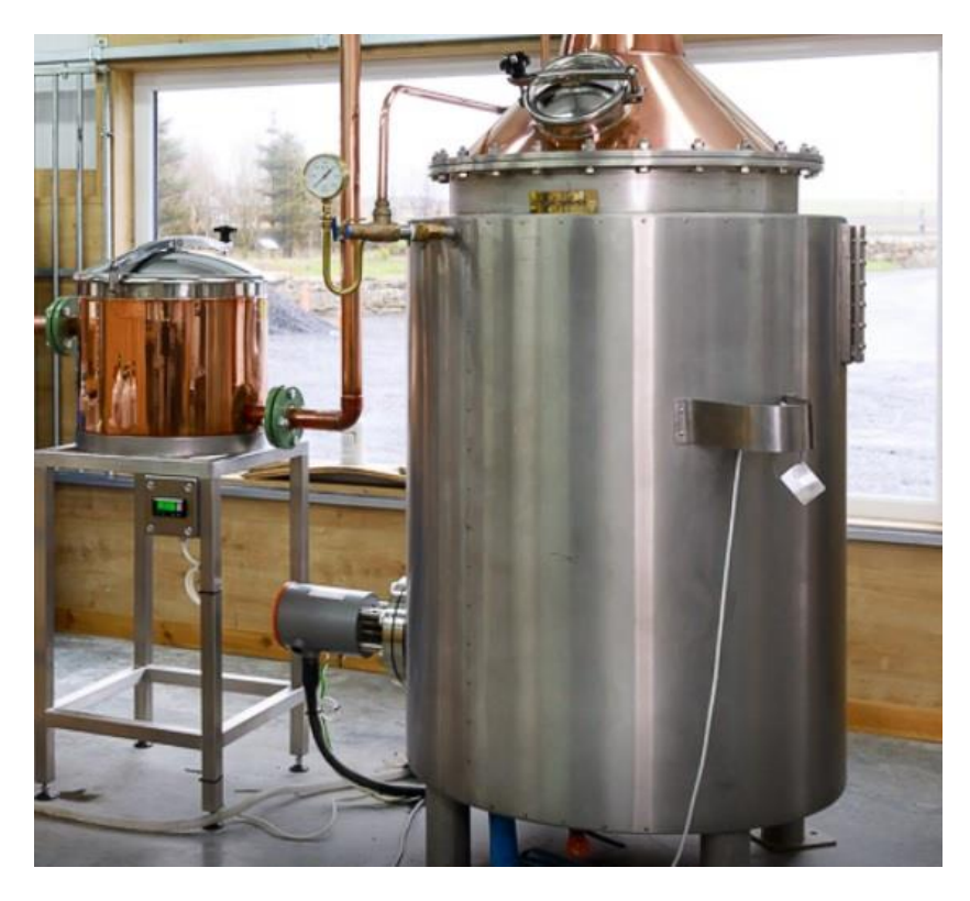
The Still House.