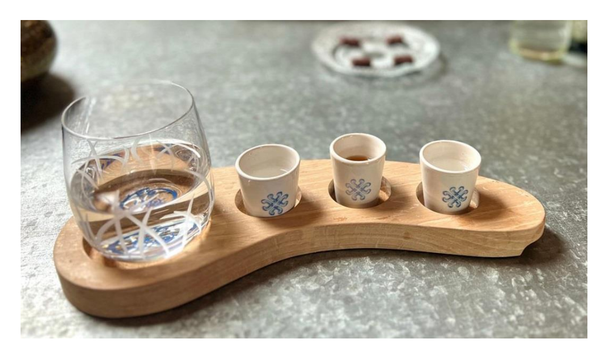
Tasting table laid for a tutored tasting session.