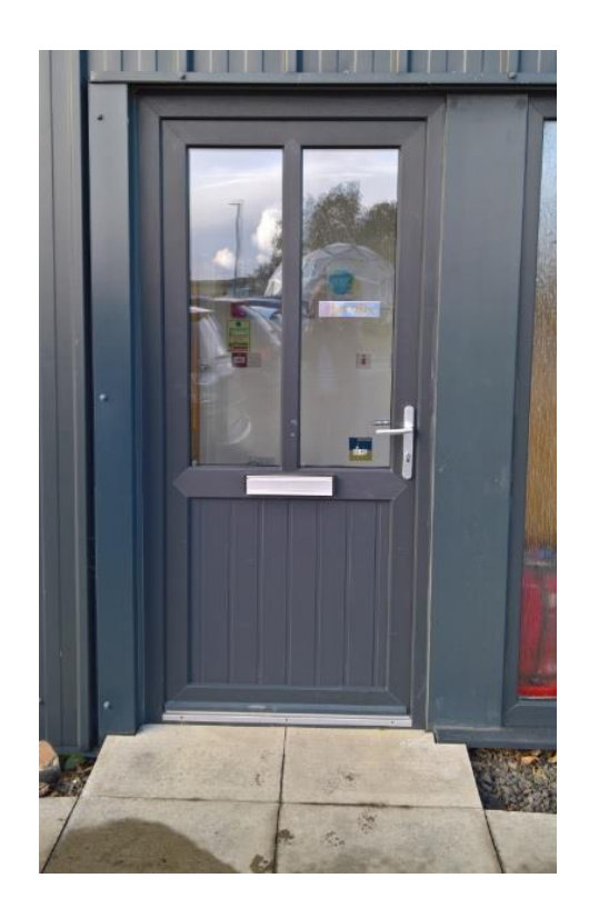
Entrance door to the Main Distillery Building.