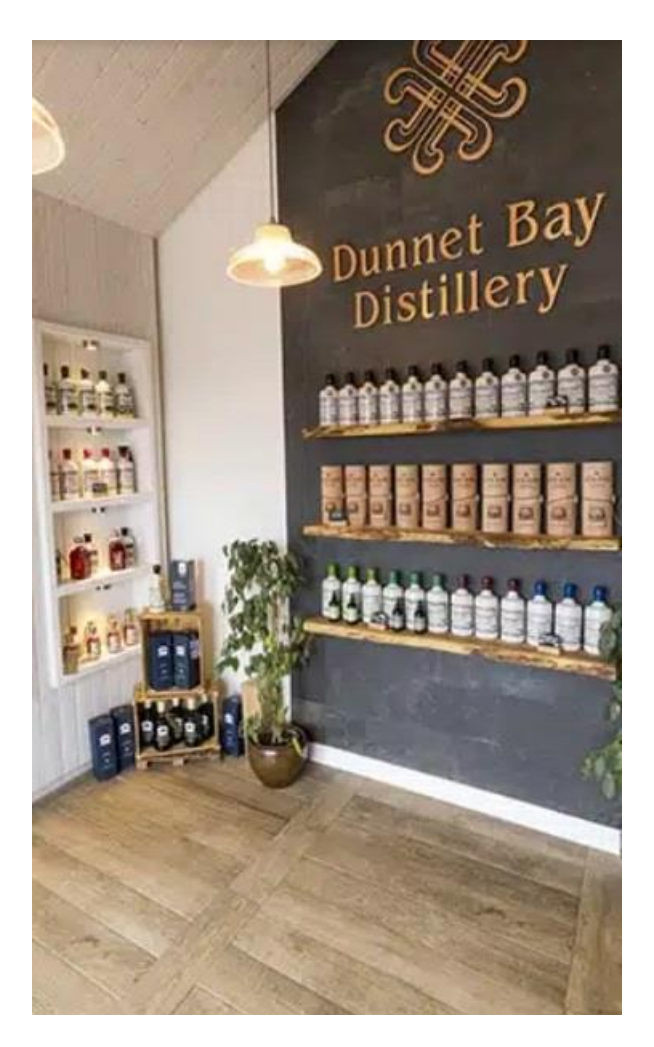
Shop merchandise displays.