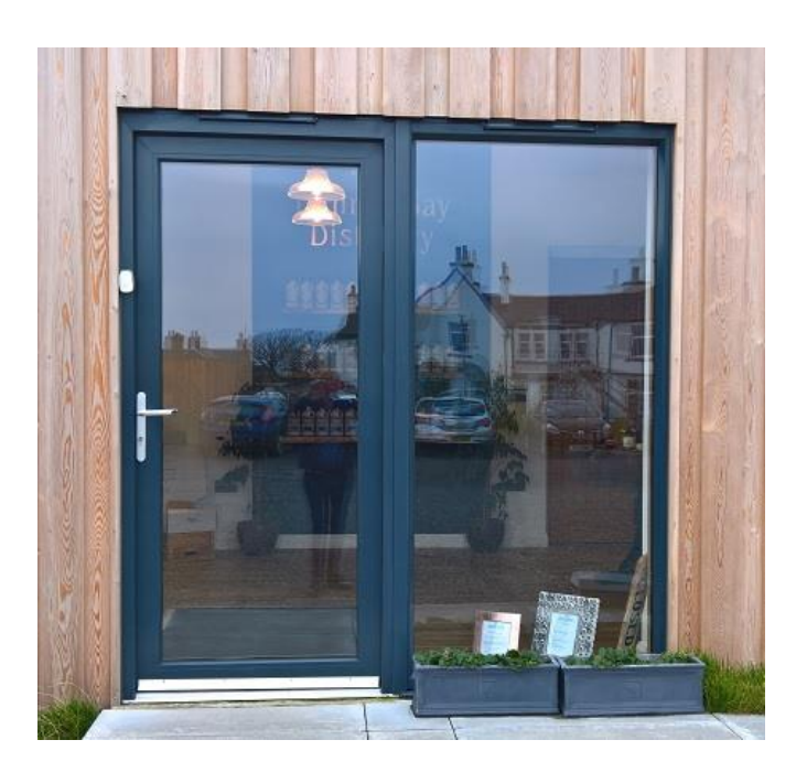
External main entrance door to the Visitor Centre.